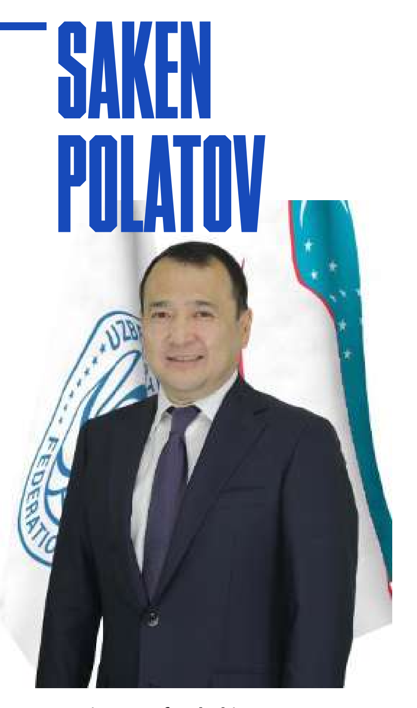
Senior VP of Uzbekistan Boxing Federation