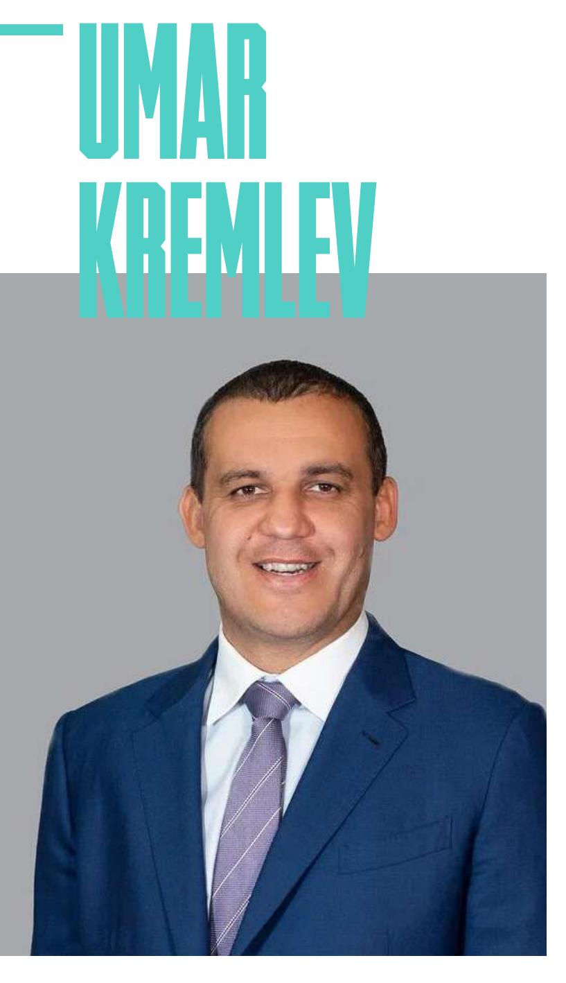
President of International Boxing Association (IBA)