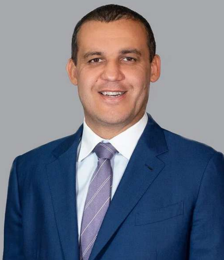
President of the International Boxing Association (IBA)