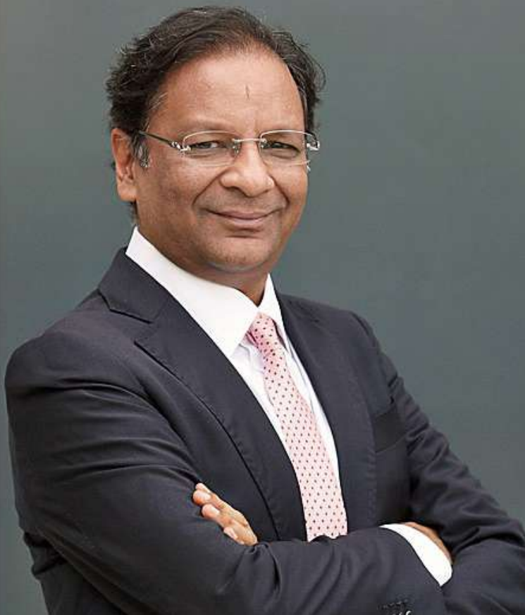
President of the Boxing Federation of India (BFI)