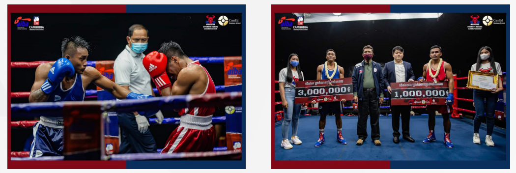
Picture 2. CFB Biweekly Boxing Competition 2021. Cambodia. November 2021.

The budget for the exact planned prizes per winning and losing bouts was provided to IBA in the supporting documents.