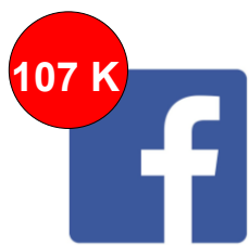
VIEWS OF VIDEOS