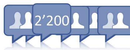
NEW FOLLOWERS (on Facebook)