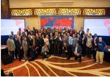
AIBA CONTINENTAL FORUM IN PANAMA, PANAMA, JANUARY 18, 2020