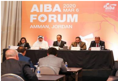
AIBA CONTINENTAL FORUM IN AMMAN, Jordan, March 6, 2020