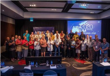
AIBA CONTINENTAL FORUM IN NADI, FIJI, FEBRUARY 22, 2020